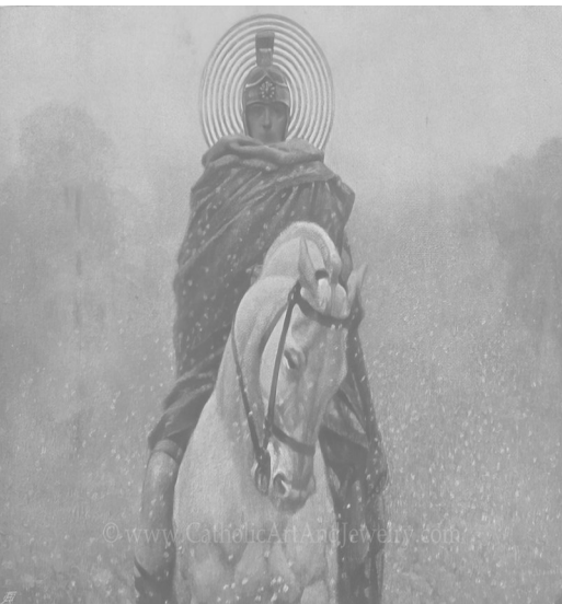
St. Martin of Tours Feast Day November 11th

Please let the office know if you have not received your envelopes, or if any information needs to be corrected or updated.