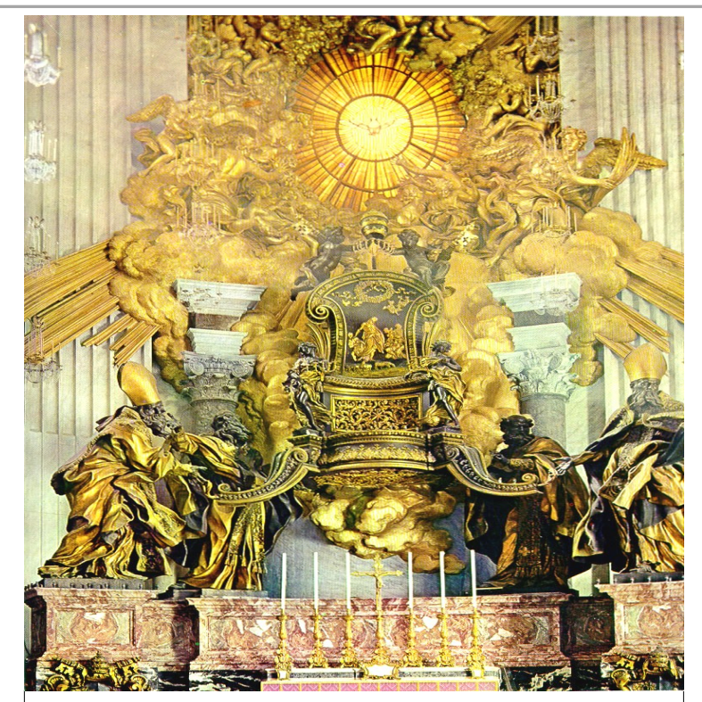
The Chair of St. Peter the Apostle