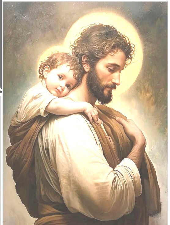
St. Joseph March 19th

Hail, Guardian of the Redeemer, Spouse of the Blessed Virgin Mary. To you God entrusted his only Son; in you Mary placed her trust with you Christ became man. Blessed Joseph, to us too, show yourself a father and guide us in the path of life. Obtain for us grace, mercy and courage, and defend us from every evil. Amen.