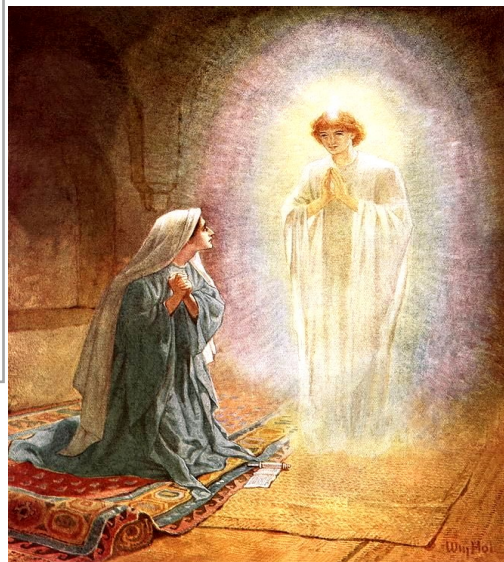
The Annunciation of the Lord Feast day March 25th.

If schools are closed due the weather conditions..morning mass will be canceled.